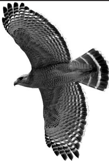
Red-shouldered Hawk at Captain Forster Hammock Preserve during ORCA volunteer walk on 3/24/10

Pelican Island Audubon Society, Inc. is registered with the Florida Dept. of Agriculture & Consumer Services. A copy of the official registration and financial information may be obtained from the Div. of Consumer Services by calling toll-free within Florida 1-800-435-7352. Registration does not imply endorsement, approval, or recommendation by the State.