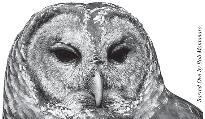
Barred Owl

Thank you to all who contributed so far! We are still in need of an additional $25,000. If you have not done so, please consider giving to this wonderful cause to enhance environmental education in Indian River County.