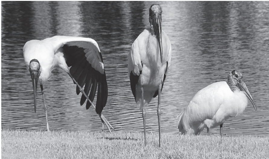
“Stretch, Stare and Sit...3 Wood Storks” by Don Morris

Place taken 01-12-2010: my back yard in Grand Harbor Camera: Casio EX FH 20 point and shoot on tripod Lens: 520mm zoom 1/500sec f 8 ISO 100